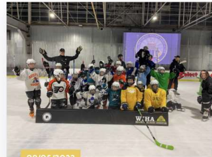
Wellington Launches Learn To Play Programme With Support From NZIHF