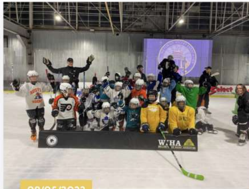
Wellington Launches Learn To Play Programme With Support From NZIHF