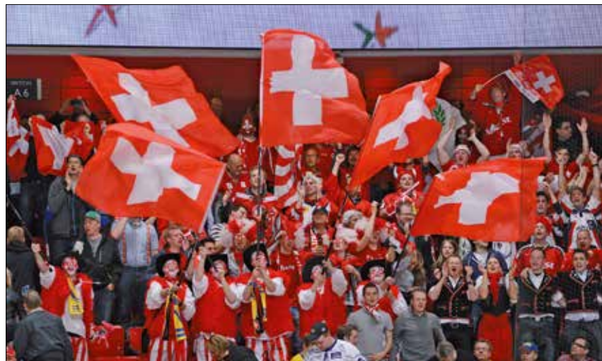
The Swiss National League A is the league with the highest attendance, and SC Bern the most popular club.