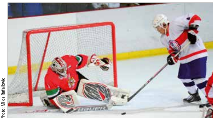
Chinese Taipei has won more Challenge Cup of Asia titles than any other nation, with three.