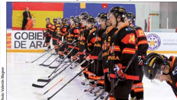
Winning the Division IIB tournament, Spain's men's teams have a gold and two silvers in 2014.