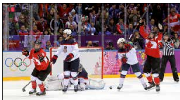
Moments after Poulin's OT winner gave Canada its fourth Olympic gold.

they do. Probably the biggest difference is that I did a lot of explaining, for why I put a line together or had someone on the power play, that kind of thing.