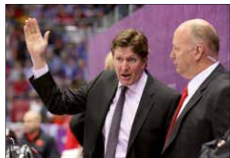
Mike Babcock added another Olympic gold to his resume.

Their meticulous planning – aided by expert consultant and ex-Switzerland coach Ralph Krueger – enabled Canada to end an overseas Olympic drought dating back to 1952. When opponents are as stifled as Canada's were, much of the credit belongs behind the bench.