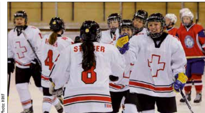
Switzerland won the 2014 IIHF U18 Women's World Championship Division I Group A.