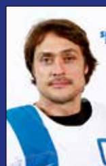
Teemu Selanne, F, FIN MVP All-Star Team Forward 6 GP, 4 G, 2 A, 6P, +3