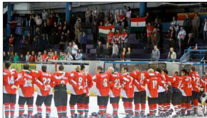
Hungary's national men's U18 team earned promotion for the second year in a row.