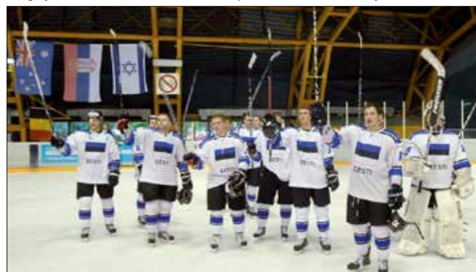
Estonia's senior men's team swept the field to win the Division IIA World Championship.