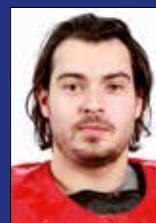
Drew Doughty, D, CAN All-Star Team Defenceman 6 GP, 4G, 42A, 6P, +4