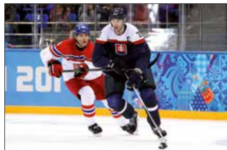
Zdeno Chara and Jaromir Jagr likely played their last Games.

The only surprising result for the former Czechoslovakia at these Games was when the Slovaks fell 3-1 to overachieving Slovenia in round-robin play. The Czechs, who came fifth, and the Slovaks, who were 11th, have gotten all the mileage they can out of aging stars like Jaromir Jagr and Marian Hossa. With little top-end young talent on the horizon, finishing off the Olympic podium is likely to become routine for both nations.