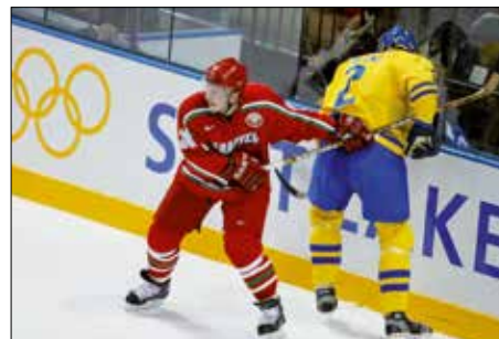
Can Belarus put together a miracle like in Salt Lake?