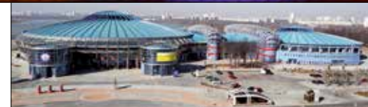
Minsk Arena (top) and the newly-built Chizhovka Arena (bottom).