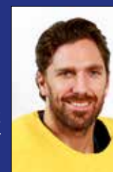
Henrik Lundqvist, G, SWE All-Star Team Goaltender 5-0-1, 1.50 GAA, 94.34 SVS%