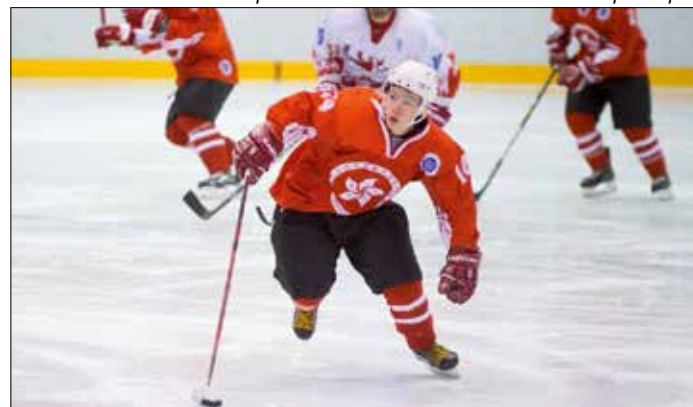
Hong Kong returned to the IIHF World Championship program after a 25-year absence.