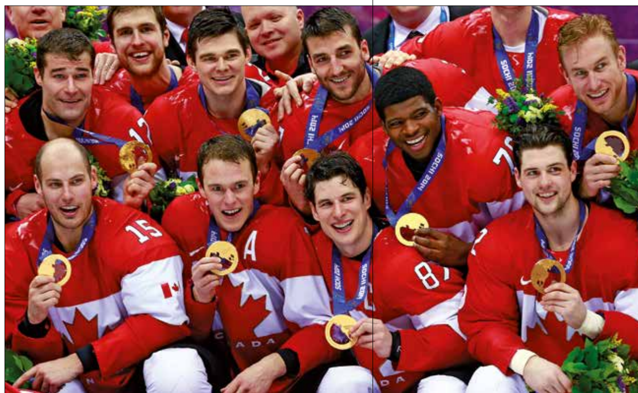
For all its offensive firepower, defence is something Canada took to extremes. In Sochi, the defending champs from Vancouver allowed just three goals in six games.

Tre Kronor had a perfect record prior to the final despite lacking captain Henrik Zetterberg and 2010 NHL scoring champ Henrik Sedin (not to mention Nicklas Backstrom's unfortunate doping disqualification versus Canada). And