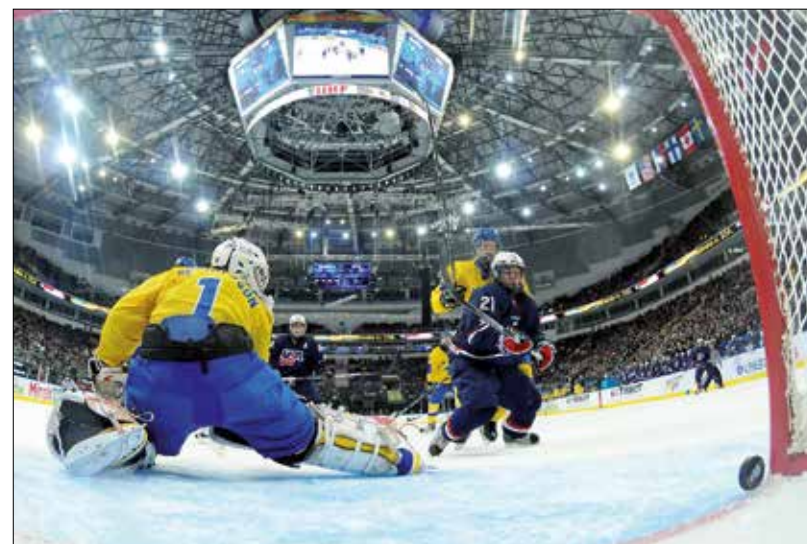
Belarus hockey's pride and joy, Minsk Arena (pictured) will host the gold medal game on 25 May.

He won't deny, though, that beating Sweden had really