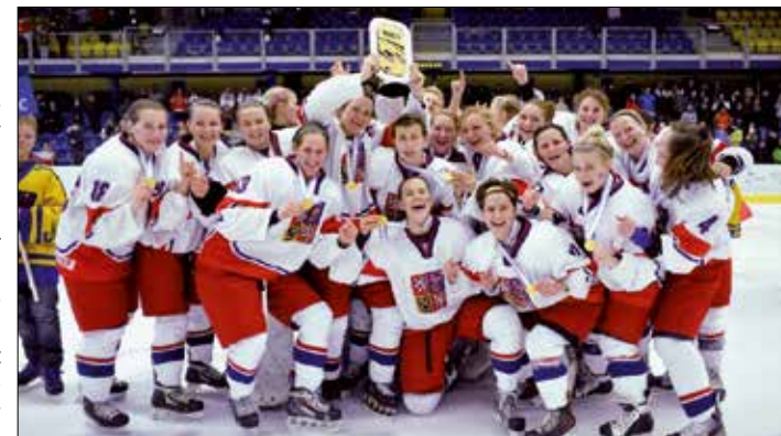
The Czech Republic will play Japan in a qualification series for promotion to the top division.