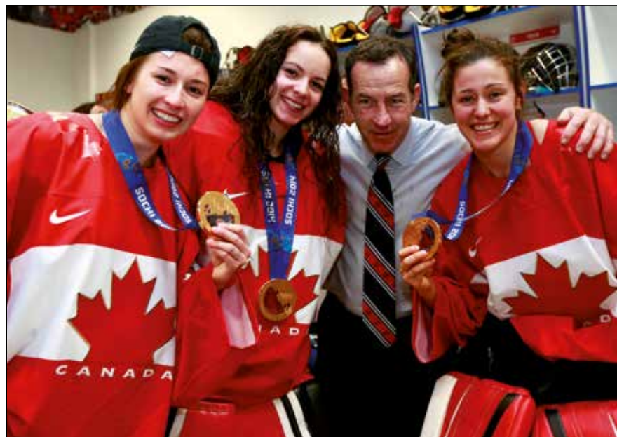
Kevin Dineen and Team Canada's journey to Sochi gold had drama and thrills right up until the very end.