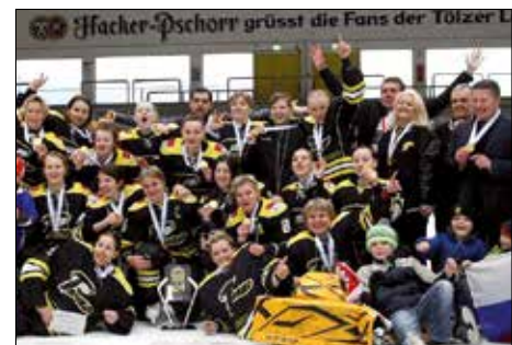
Tornado is undefeated in each of its last three EWCC finals.