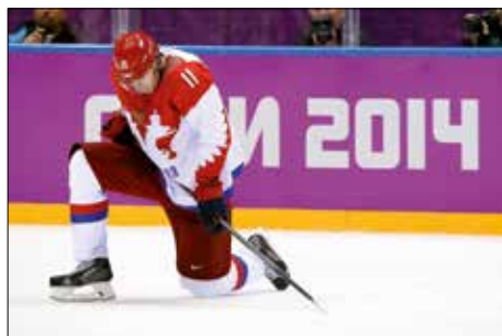
Russia's disappointing finish was a tough pill to swallow.

For Russia, this is particularly damning, considering that the 28-club circuit specifically adjusted its schedule to suit the national team.