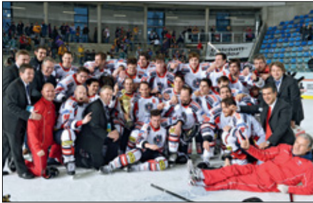
Austria ended Germany's Olympic participation streak.

Slovenia will play in the Olympic men's ice hockey tournament as the lowest-ranked team (18th) and will be seeded in Group A together with Russia, Slovakia and the United States.