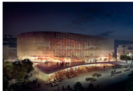
Once built, Copenhagen Arena will be the first indoor sports facility of its size in Denmark.