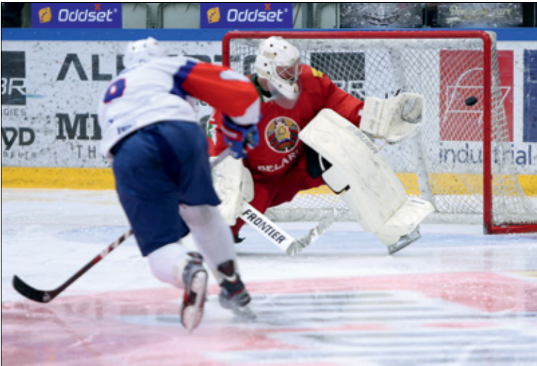
A key win against favourites Belarus in the opening game helped clear Slovenia's path to the Games.