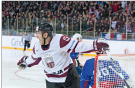
Latvia was the only men's tournament host to advance.

But then Darzins into cut the lead, putting Kazakhstan in pole position for some minutes. But after 12 seconds in the