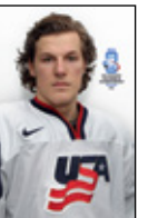
Jake McCabe: All-Star Team Defenceman