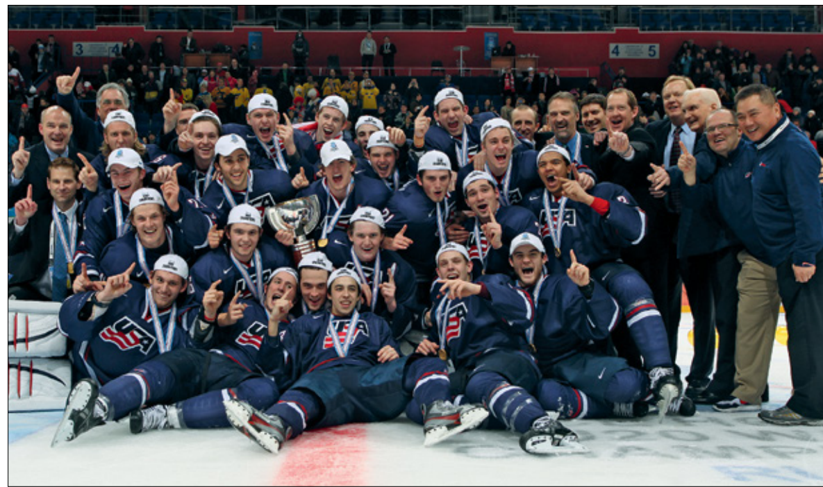
Earning respect: The United States bounced back from a seventh place finish in 2012 to capture its second World Juniors gold medal in three years.

Canada, the perennial World Junior favourite, fell short in its golden quest for the fourth consecutive time. Worse