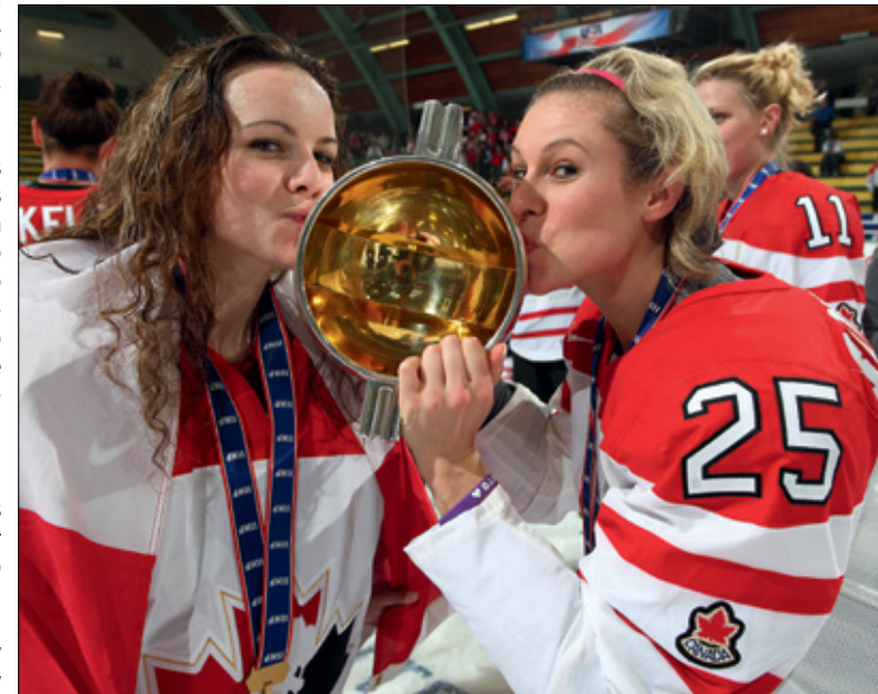
Party in the nation's capital: 2012 World Champions Canada get to defend their title on home ice.

■ The preparations began pretty much immediately after Hockey Canada considered the bids in April 2011, and the combination of this remarkable collaboration as well as Ottawa's successful hosting of the U20 tournament in 2009 was more than enough to convince Hockey Canada that Canada's capital city was the place to be in 2013.