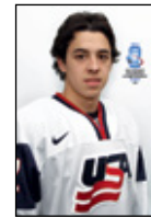
John Gaudreau: All-Star Team Forward