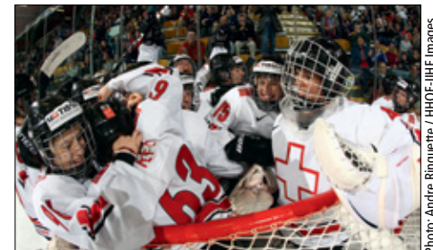
Switzerland was last year's Cinderella story, winning bronze.

aforementioned schedule. At first, the games were to take place during the final week of the NHL calendar, meaning the Senators would have to go on the road for the last week and a half of the season. In a league where playoff spots are often determined in the final days, that could have had a crucial result on the team's NHL season. But, thanks to the labour conflict and delayed season, those worries have been removed.