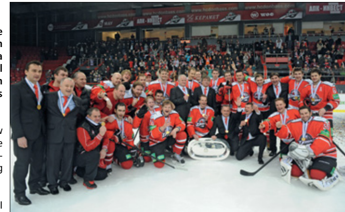
The Ukrainian champions surrendered just one goal and netted 11 in three games.

His players seemed to understand very well. After a rough start with a tight 1-0 victory against Belarusian champion Metallurg Zhlobin, the Ukrainians followed up with a 3-0 blanking of Italy's Bolzano Foxes before defeating Rouen in the deciding game.