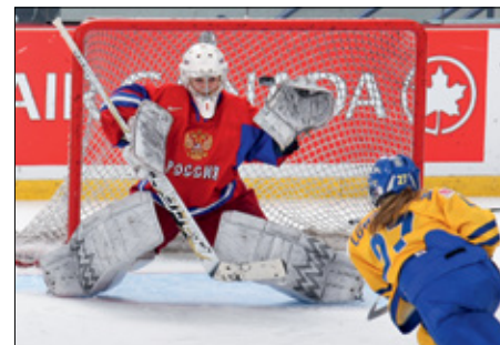
The upcoming tourney is shaping up to be the biggest yet.