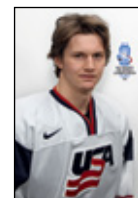
Jacob Trouba: All-Star Team Defenceman, Directorate Best Defenceman