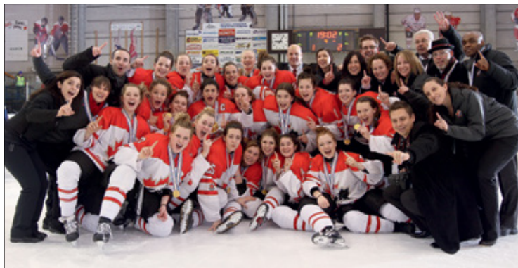
Cardiac kids: Canada left it until 12 seconds left in the final before coming back to beat the U.S.

The Hungarian ladies ended up in sixth place and will compete again in the top division next year. This, for a team that had to go through the qualification tourna-