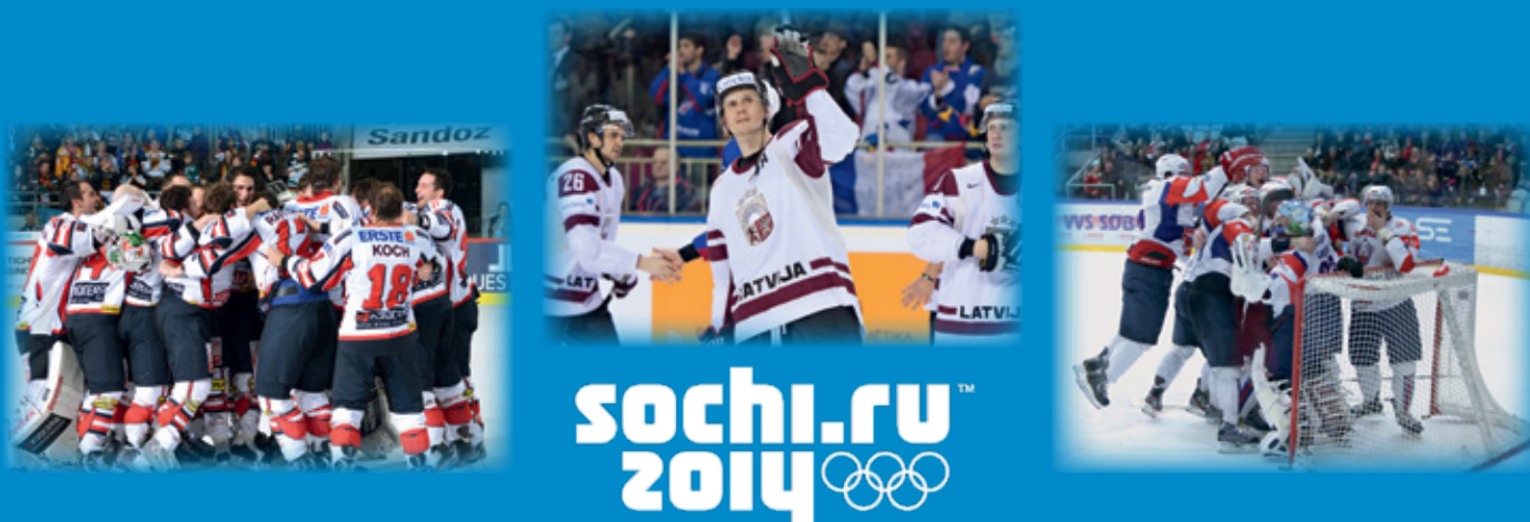
Clockwise from top: Latvia, Slovenia, Japan, Germany, and Austria have booked their ticket to the 2014 Winter Olympics, making it through the qualification phase to take their place among hockey's elite.