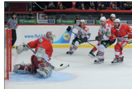
With a 2013 Continental Cup and a place in the KHL, Donbass Donetsk is spearheading a hockey revival in Ukraine.

Donbass had to sign several new players in order to be competitive and the Continental Cup included only four Ukrainian players after the departure of NHL players Ruslan Fedotenko, Olexi Ponikarovsky and Anton Babchuk following the end of the labour dispute in North America.