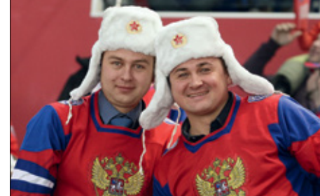
Ufa's hockey town atmosphere was plain for all to see.