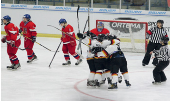
Top photo: Japan has earned its first ever Olympic trip via the qualification phase.