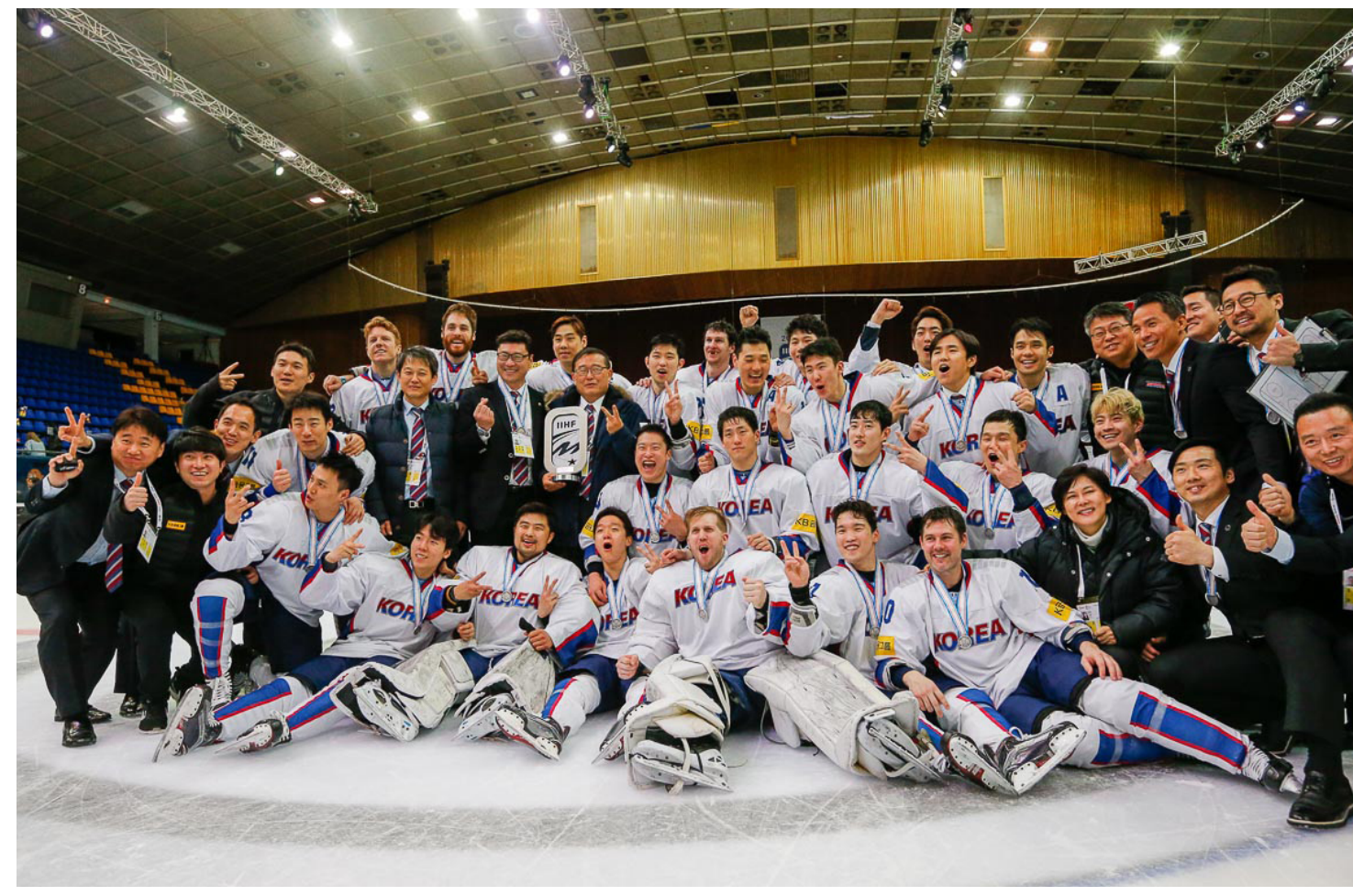
Korea celebrating with the silver trophy and medals after beating Ukraine to earn promotion to the World Championship.

"You want to come in and win every game. We