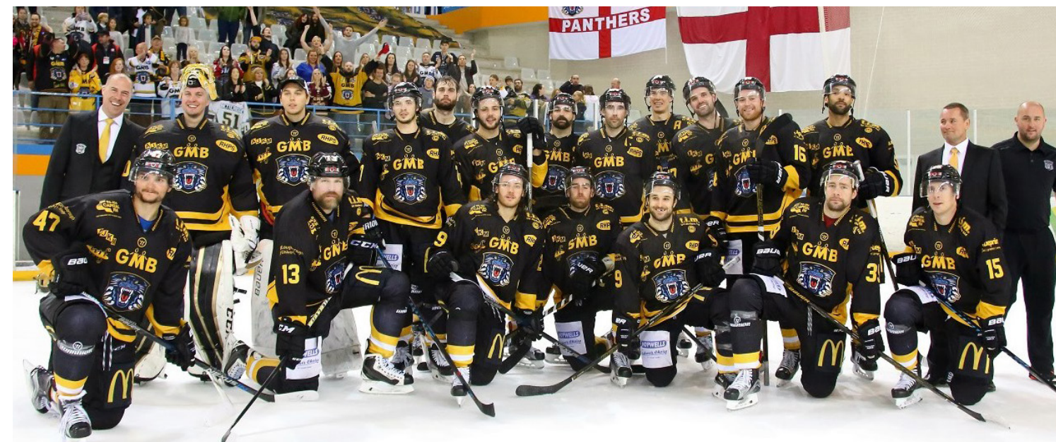
The Nottingham Panthers pose together for a team photo in Jaca, Spain after the second round of the Continental Cup.