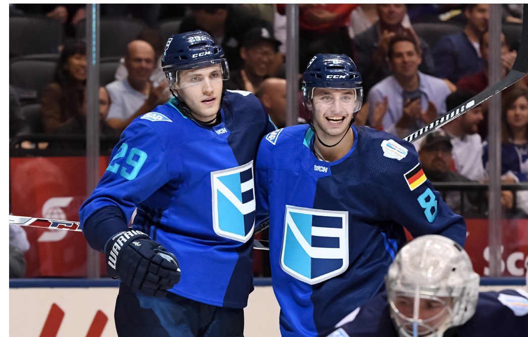
After helping their country qualify for the 2018 Olympic Games, German forwards Leon Draisaitl and Tobias Rieder played together with Team Europe at the World Cup.