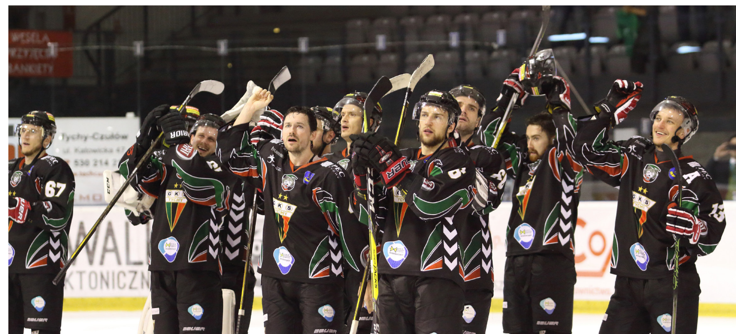
GKS Tychy salutes the crowd after the Polish club earned the right to advance in the Continental Cup by winning Group C.