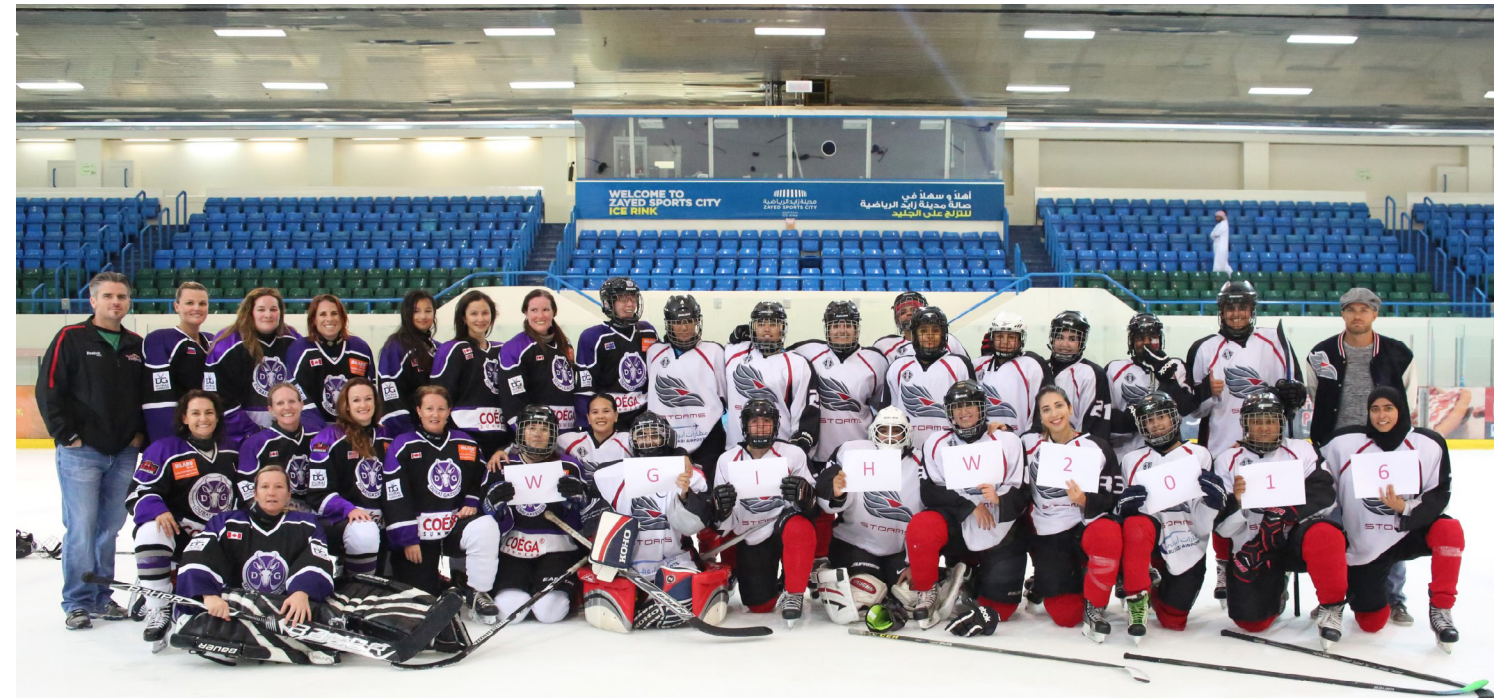
The World Girls' Ice Hockey Weekend has served as a point of introduction for ice hockey to young women since 2011.

Ice Hockey Queensland hosted one of four World Girls' Ice Hockey Weekend events in Aca-cia Ridge in the Brisbane region together with the local women's hockey team Goannas, who helped with their coaches and players, and the club Southern Stars providing the ice time and equipment for the beginners. The community replied well with 47 participants. After getting their equipment the new players had one hour for skating drills various stations which included passing, shooting, puck handling and an obsta-cle course, which produced lots of smiles and laughing from all ages.