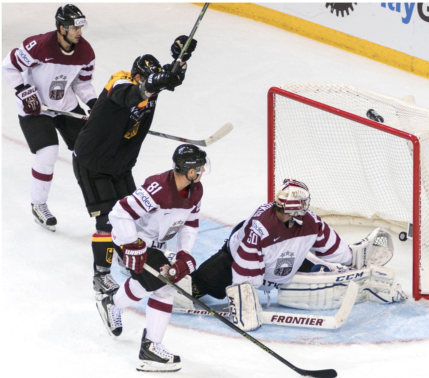
Tom Kuhnackl celebrates a goal as Germany defeated Latvia in Riga on the last day of the Final Olympic Qualification.