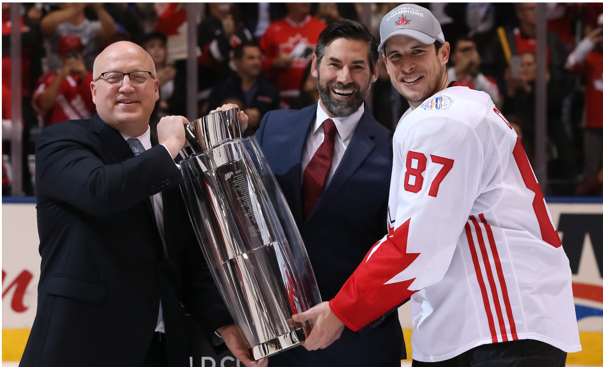
From left: NHL Deputy Commissioner Bill Daly and NHLPA executive Mathieu Schneider award the 2016 World Cup of Hockey trophy to Sidney Crosby.