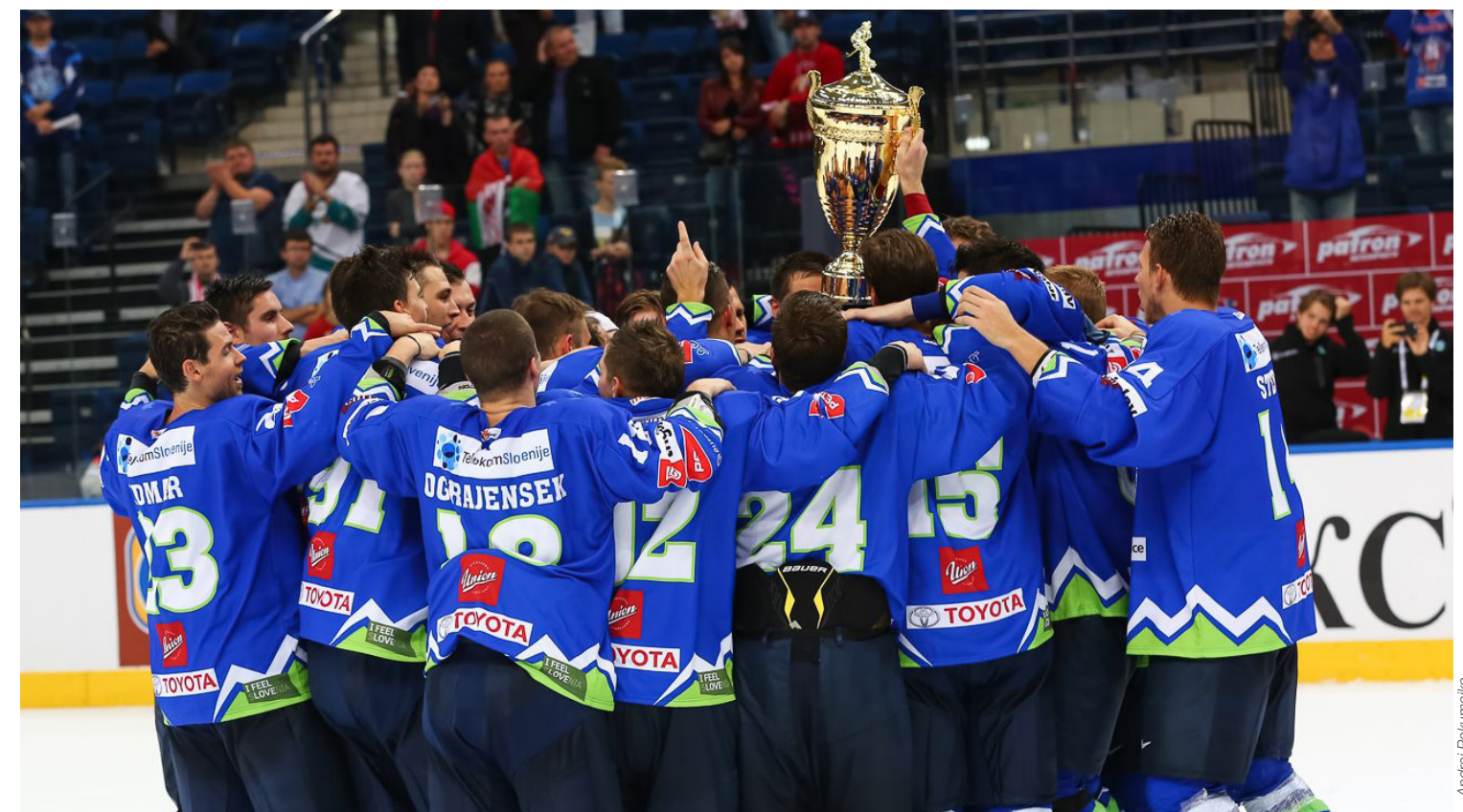
In the final game Slovenia went up 2-0 then held off a Belarusian comeback attempt to come through 3-2 in a shootout.