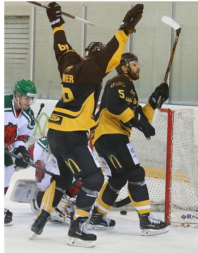
Great Britain and Poland will both have a club representing them in the Third Round of the 2017 IIHF Continental Cup.