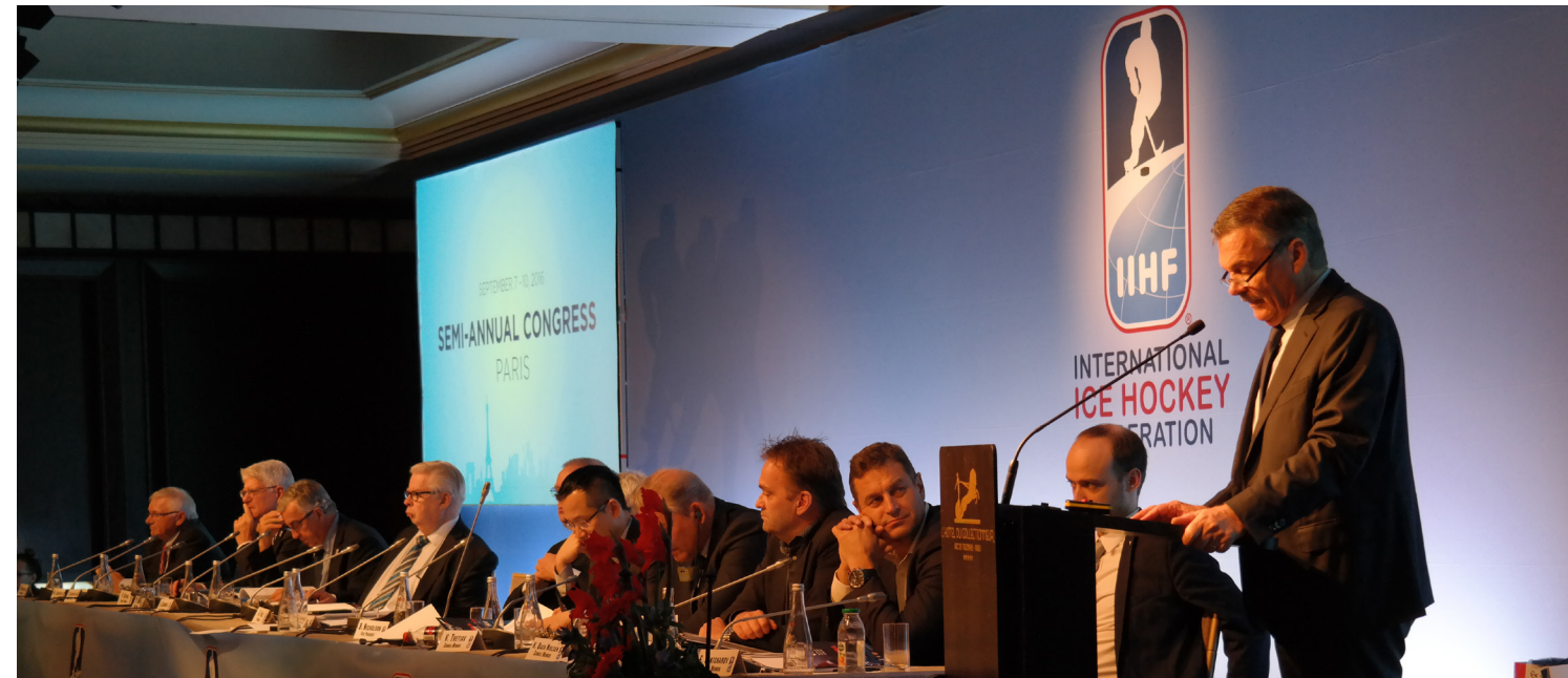
The new IIHF Council has eight returning members as well as five new faces joining the federation's executive body.