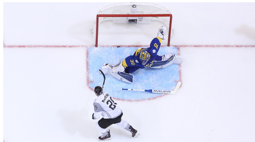
Team North America's Nathan MacKinnon scored one of the nicest goals of the 2016 World Cup, coming in overtime against Sweden's Henrik Lundqvist.